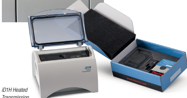
iD1H Heated Transmission Optional Accessory

Based on the popular Thermo Scientific Nicolet iS5 mid-infrared spectrometer, the Nicolet iS5N FT-NIR spectrometer integrates high-performance optics into a small, rugged package. The spectrometer is perfect for use in a wide range of settings, from small industrial facilities to global manufacturing sites.