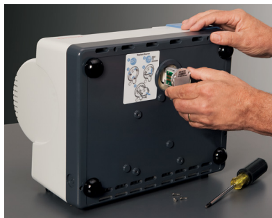
Easy, user-accessible source replacement